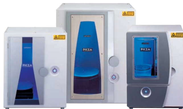
3D LASER SCANNER L PX-600 DS Compact and most affordable