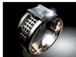
Ger de Bruijn Goldsmith - Designer, Holland www.atelierdebruijn.nl

"JWX is a machine that does the job it is made for perfectly! It is also fast, reliable and cheap to run."