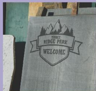
Sandblast / paint stencils