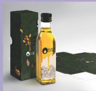
Labels and packaging prototypes