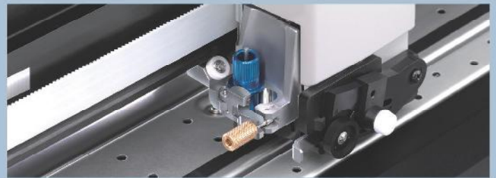
Dual position cutting carriage with sheet cutter

Delivering up to 1,485mm per second, the CAMM-1 GR cutter boasts the fastest throughput in its class. Its optimised cutting carriage drive system boosts productivity even further by minimising the vertical distance the blade has to travel and advanced weeding tools will help you keep pace with the GR's high-speed production.