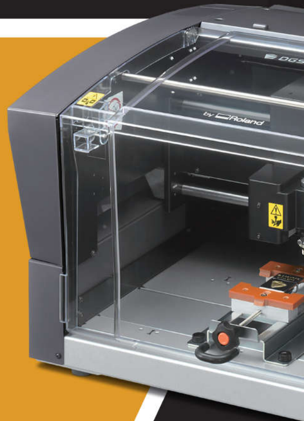
Model shown with optional centre vice

With remote machine management capabilities, the DE-3 offers USB and LAN connectivity for multiple machine engraving. Power up your production with the DE-3.